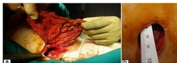
Figure 2. Closing posterior part of defect by latissimus muscle flap (A) View of defect remained at the anterior after muscle flap (B)